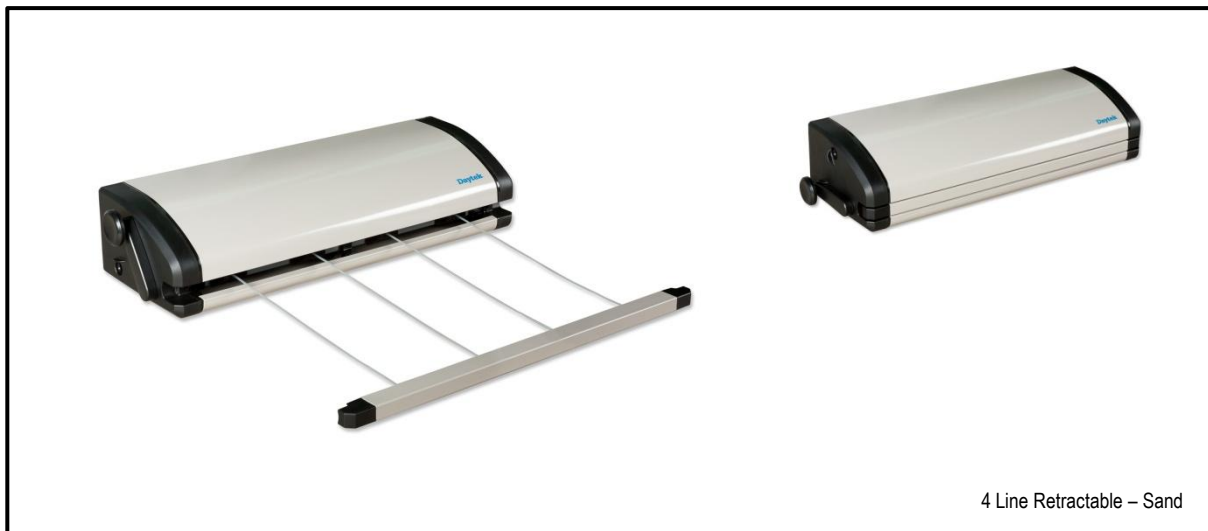
4 Line Retractable – Sand

The ultimate in space saving outdoor drying without compromising hanging space. With four lines extending out to a maximum of 7 metres the 4 Line Outdoor Retractable Clothesline provides 28 metres of drying space and easily accommodates any sheet size.